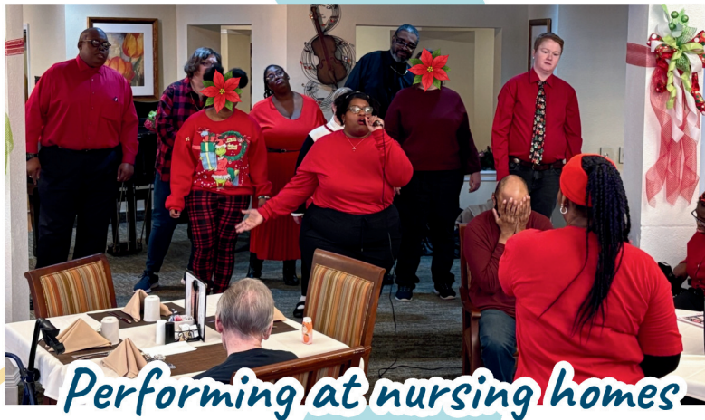
Performing at nursing homes

The Harmonies bring more than music when they visit local nursing homes—they bring joy, connection, & genuine smiles.