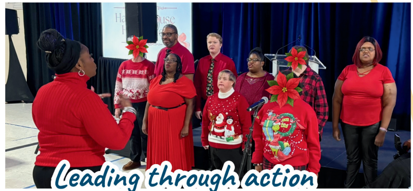
Leading through action

With a mix of holiday classics & signature songs, each performer had a solo moment to shine, filling the room with holiday spirit & showcasing their incredible talent